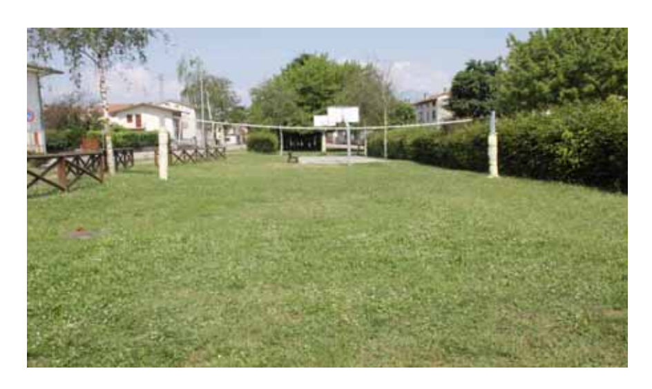
Municipal Sport Area "Proa"