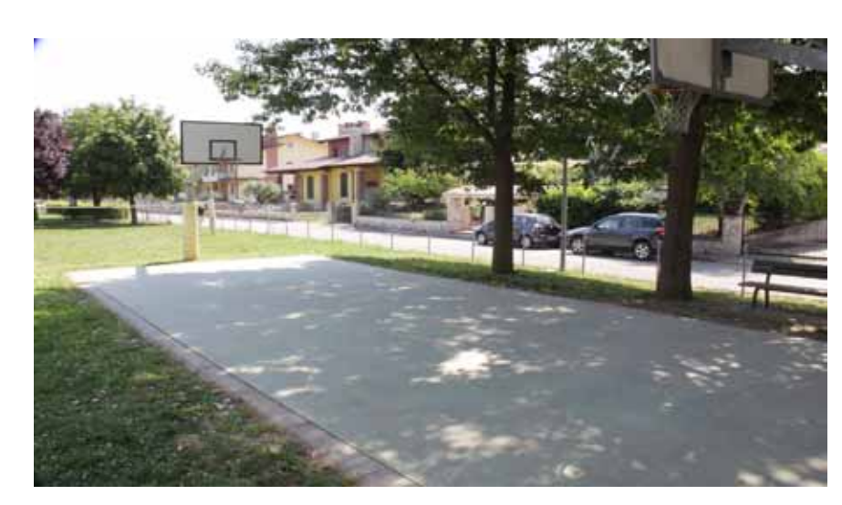
Multi-plate "via Divisione Julia"