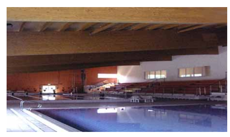
Swimming pool "Molinetto"