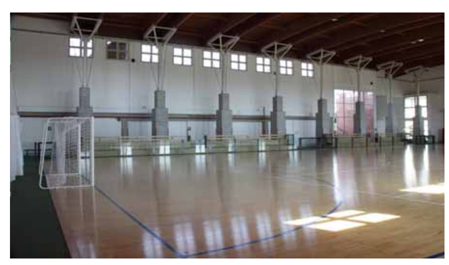
Gym Town "Palladio"