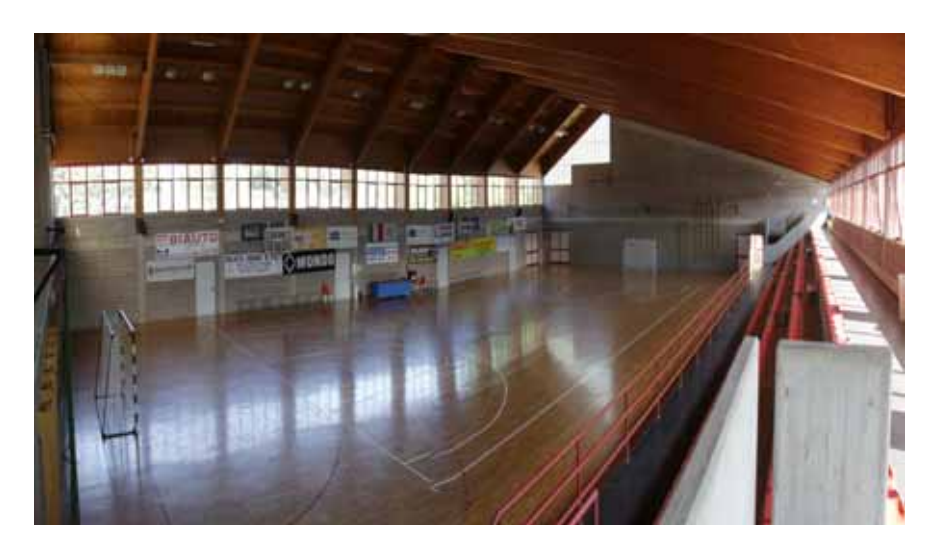
Municipal Stadiums "Deledda"