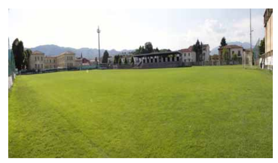
Sport Ground Malo