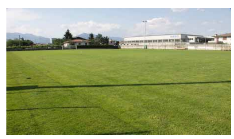
Sport Ground Santomio