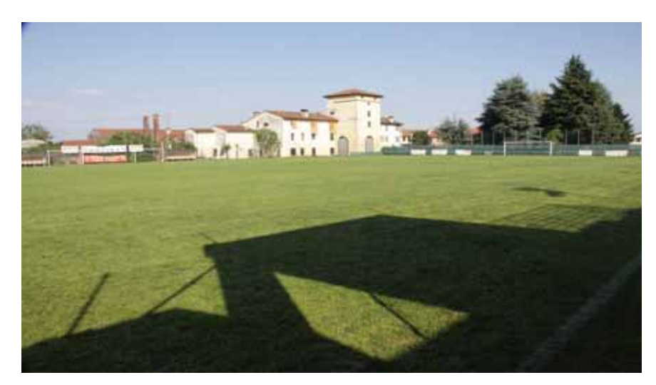
Sport Ground Molina