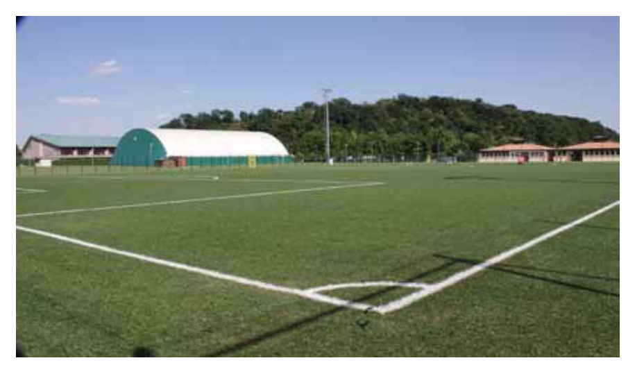
Sports Ground "Deledda" in syntetic grass