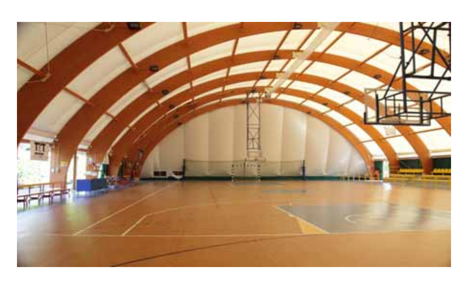
Municipal Tensile "Deledda"