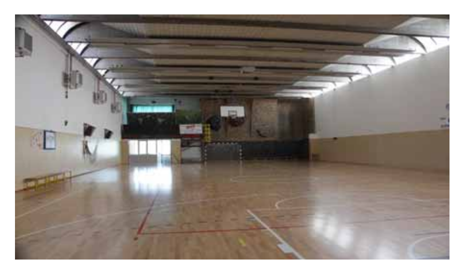
Comunal Gym "Rigotti"